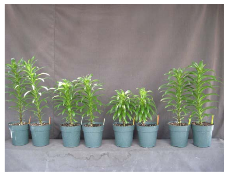
Left to right: Easter lilies treated with: Control, 20 seconds per day touching the leaves (mechanical stress) 2 ounces cold (3C) water poured on the growing point, or 2 ounces 20C water poured on the growing point. Image 1649.

We did this experiment based on results from Blom et al. in Guelph, Canada, who published research on this technique several years ago. Their results showed the colder the water, the shorter the plants that resulted, so it is not necessary to use water that is specifically 3C. It would be interesting to see what effect, if any, cold water applications have on spring bulb growth.